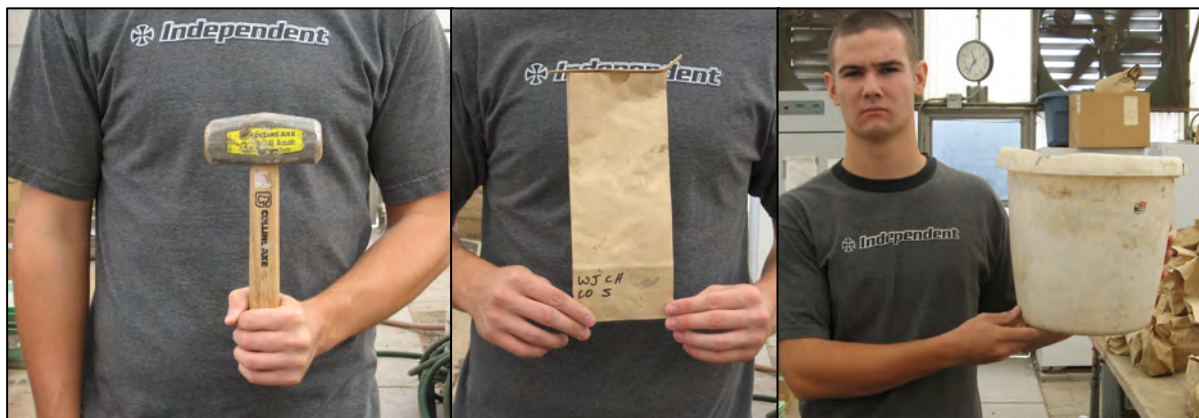
Three Pound Sledge

Proceed to auger to your first measuring point. It may be possible to core to 15cm or clay may clog the teeth and necessitate unloading the bit earlier than 15cm. To empty the bit; remove the auger from the hole, hold it over a bucket and have a third person bang on the bit with a 3lb metal sledge until all of the contents of the bit fall into the bucket. The metal sledge sends vibrations through the bit, loosening the material. The banging slightly damages the bit, but not significantly and the bit will need to be replaced before the sledge makes any major changes to the bit. The process requires three people to be effective; two for drilling one for emptying the bucket and labeling the bags.