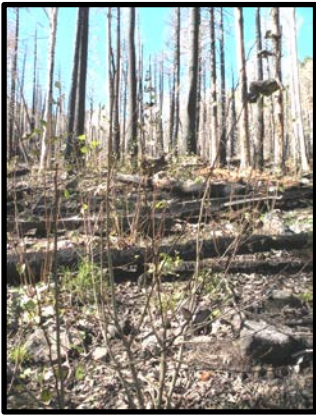
Browsed aspen suckers soon after wildfire in northern Arizona

Regardless of disturbance or aspen type, maintaining aspen resilience is highly dependent on local levels of ungulate herbivory (Seager et al. 2013). In the West, prominent aspen browsers include cattle, sheep, elk, and deer. If great care is not taken to protect post-disturbance and post-treatment stands from