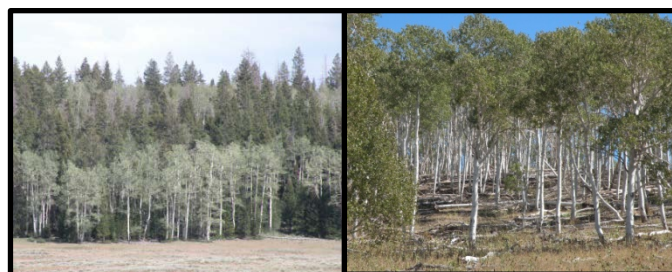
Montane seral (L) and Colorado Plateau stable (R) aspen

use. The elevated level of forest and rangeland burning during this period resulted in many of the mature aspen forests we see today (Kaye 2011).