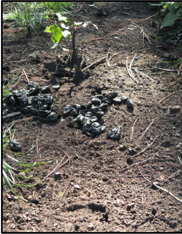
Elk scat and browsed aspen sucker following a wildfire in Arizona.

3) Aspen abundance : The density and extent of aspen also matters, with large, dense stands generally regenerating better. Whereas the fires in Yellowstone in 1988 were large and severe, there was still significant aspen and willow decline due to herbivory because there was limited browse material in this landscape to begin with. We have observed similar problems in southern Utah where patchy aspen stands regenerating after fire are browsed heavily even when ungulate populations are moderate.