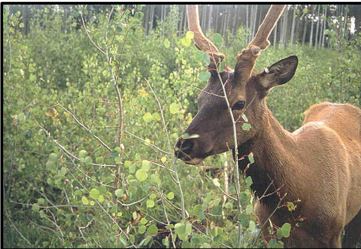
Elk browsing aspen

Aspen plays a fundamental role in facilitating post-disturbance re-establishment of forest communities, but intense browsing by ungulates can be detrimental to aspen establishment and recruitment (Seager et al. 2013). A regional survey of aspen understories across central and southern Utah showed that approximately 40% of aspen stems display evidence of browsing. Incidence and severity of browsing vary, suggesting that there are multiple factors that influence aspen browse susceptibility. However, aspen forests only require 500 to 1,000 suckers per acre to escape herbivory and recruit into the overstory for the stand to persist.